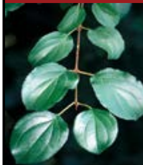
Invasive Species - Common Buckthorn "Rhamnus cathartica"