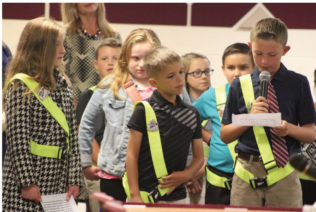
Leading the Pledge